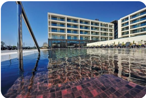
Hotel Vila Galé Coimbra ****

R. Abel Dias Urbano 20, 3000-001 Coimbra +351 239 240 000