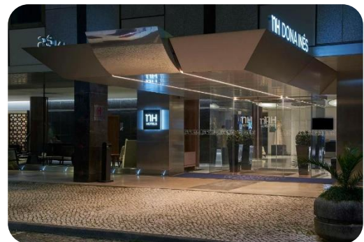
Hotel DONA INES ****

R. Abel Dias Urbano 20, 3000-001 Coimbra +351 239 240 000