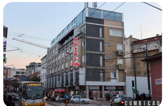
Hotel Oslo ***

R. João Machado 4, 3000-226 Coimbra +351 239 858 300